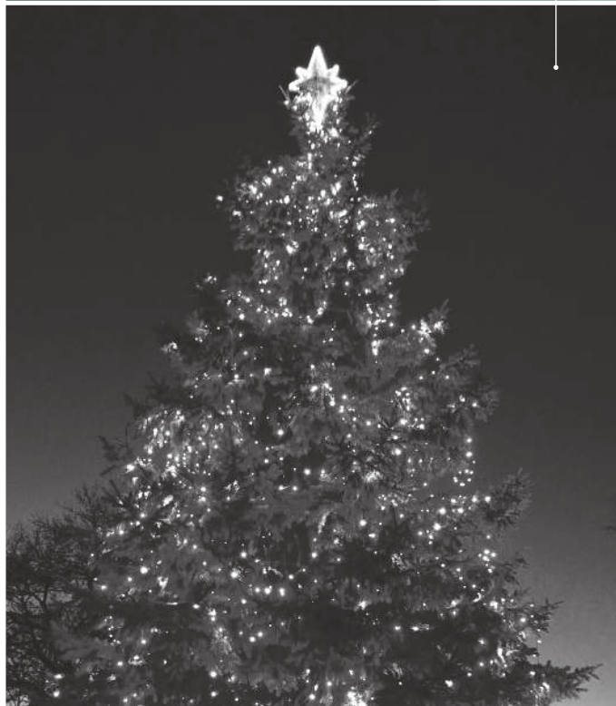
2015 Love Lights